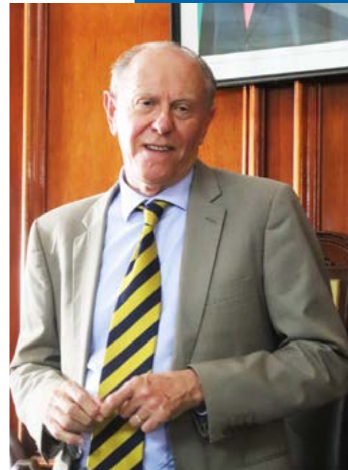
His Worship Senator David Coltart, The Mayor

My call on all residents is to keep our city clean and adhere to all the By-laws. Various initiatives have been proposed by Council for 2024 to address the challenges we face as a City.