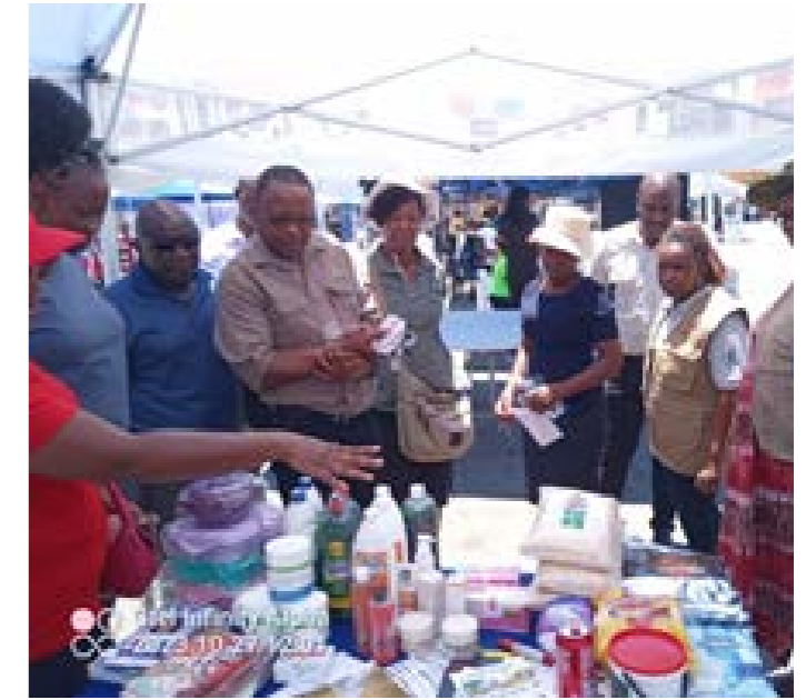
Stakeholders at the Small and Medium Enterprises Expo at the City hall

and Public Partnerships. Expos and Exhibitions are also conducted to promote Horizontal and Vertical linkages for SMEs.