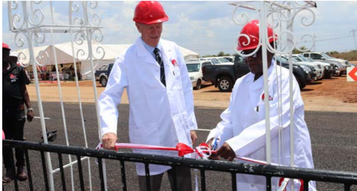
The Minister of State for Provincial Affairs and Devolution, Hon. Judith Ncube and the Mayor, Senator David Coltart cut the ribbon at the Mahatshula East handover.

H is Worship Senator David Coltart, the Mayor has highlighted the importance of Public Private Partnerships in housing development, noting that these are key in securing the delivery of affordable homes to the populace.