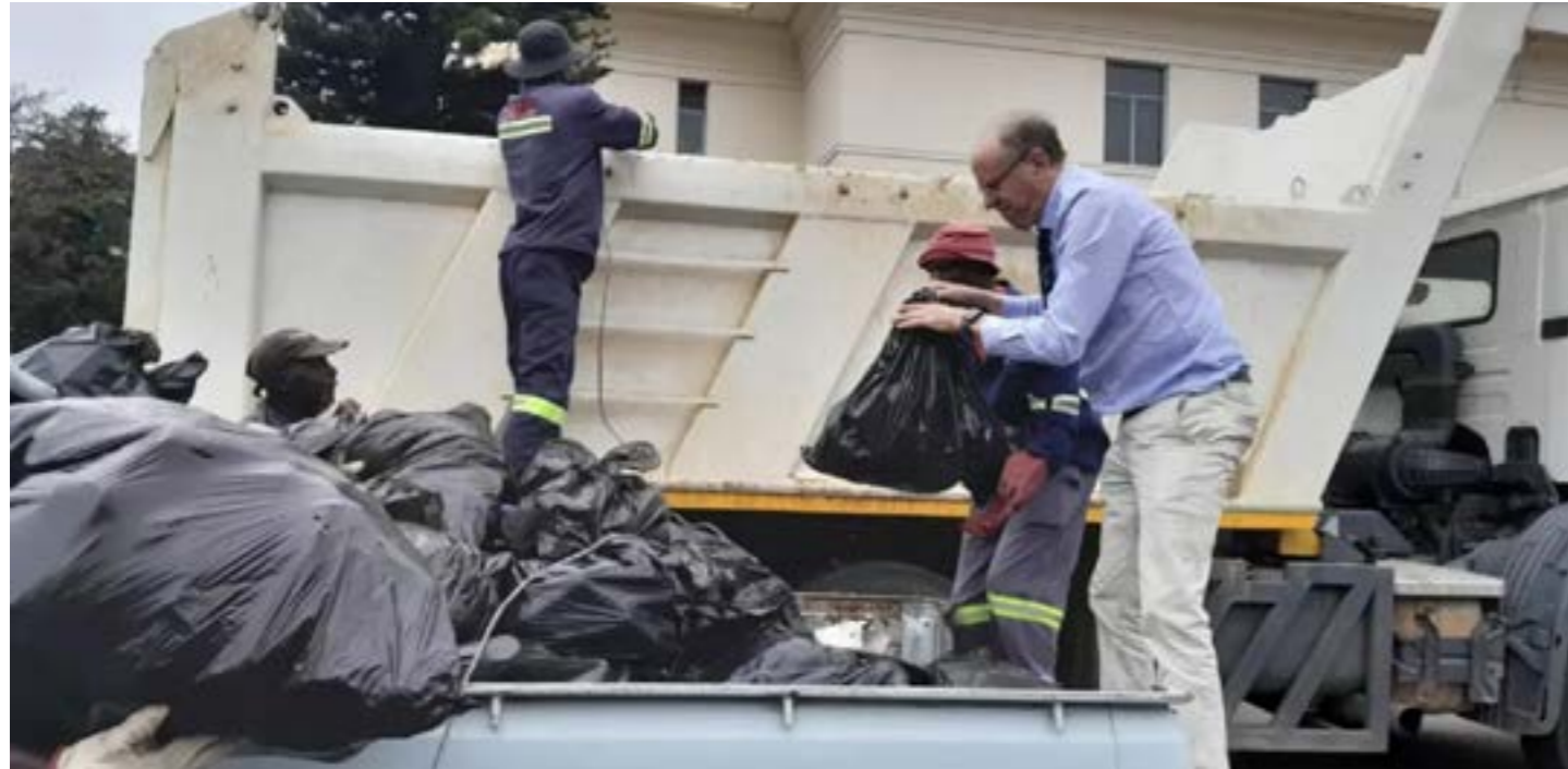
His Worship Senator David Coltart, The Mayor loads refuse into a tipper truck during the City's Spring Cleaning Campaign.

Pursuant to the launch of the Local Authorities Service Delivery Blueprint by His Excellency the President of the Republic of Zimbabwe Cde Dr Emmerson. D. Mnanganwa on the 1st of November 2023, the City of Bulawayo has set out urgent strategies to be used to achieve the expectations of the Call to Action.