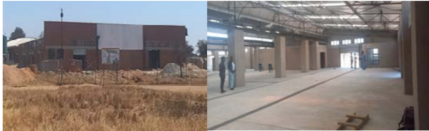
The Nkulumane Wholesale Fruits and Vegetable Market

M icro-Small and Medium-Sized Enterprises (MSMEs) play a pivotal role in the economic and social development of cities. They serve as the bedrock of Urban Local Economic Development, contributing significantly to employment, job creation, poverty reduction, and overall economic growth. Additionally, MSMEs foster innovation, entrepreneurship, and social inclusion, making them indispensable for building resilient, sustainable, and vibrant cities. MSMEs play a crucial role in achieving the United Nations Sustainable Development Goals (SDGs). Against the backdrop of economic challenges facing the country, the City of Bulawayo, hereinafter referred to as CoB, through its various Departments, has embarked on a series of measures to ensure that MSMEs are resilient and sustainable. The CoB has adopted an MSME resilience framework that encompasses clear and robust Policies, partnerships, workspace and infrastructure provision, land provision, cluster development, training and capacity development, and business linkages.